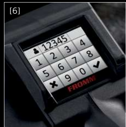
[6] Locking of the Tool settings