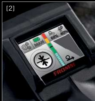
[2] Advanced mode