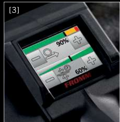
[3] Tension force and Welding time