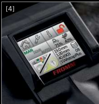
[4] Settings menu