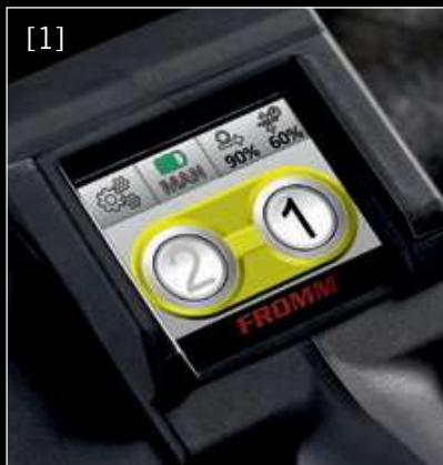
[1] Classic mode

Easy to operate with factory gloves of all kinds!