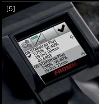
[5] Strap database